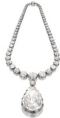
Antique Diamond Pendant Necklace, Courtesy of Siegelson, New York