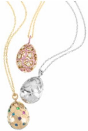
Les Favorites de Fabergé