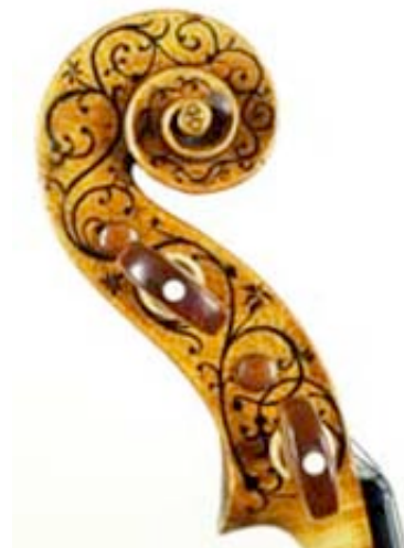
Antonio Stradivari, Trimmed Stradivari Courtesy of Rare Violins of New York, Inc., New York